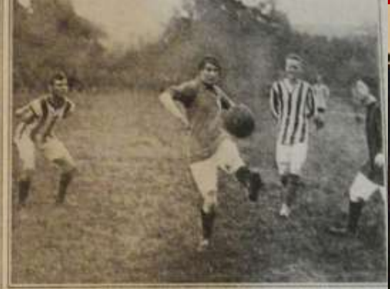
Senartly "exact" by the ledies' goulkeness, and tright an emidded in the parts. The acidities were handing-past by having their bands between both them all events the goldeness, who was allowed one wond too.