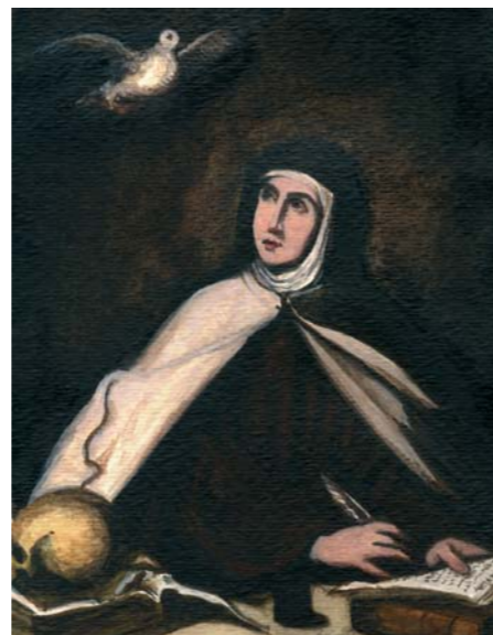
Watercolor inspired by Zurbarán's Saint Teresa of Jesus. A. Dubois.